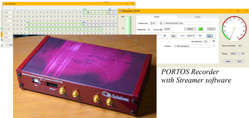
PORTOS Recorder with Streamer software