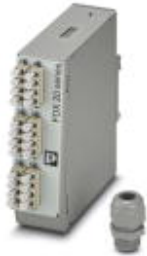
DIN rail splice box, fully mounted ready to splice, for 12x LC duplex (OM4)

Please be informed that the data shown in this PDF Document is generated from our Online Catalog. Please find the complete data in the user's documentation. Our General Terms of Use for Downloads are valid ( http://phoenixcontact.com/download )