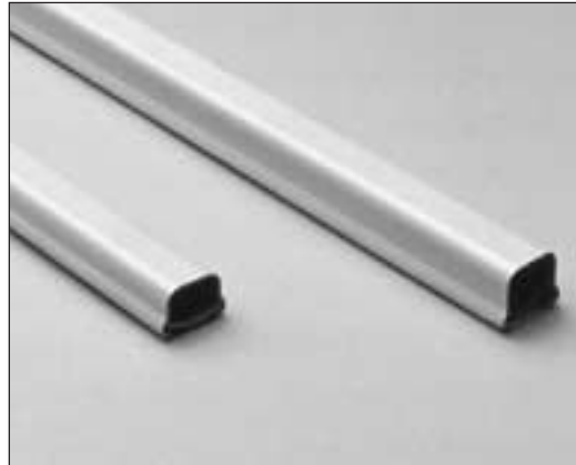
V500 and V700.

Deal for surface mounting small amounts of electrical wiring or communication cables. These rugged raceways offer a low profile appearance which blend with any decor. V500, V700, and 700WH come in our exclusive ScuffCoat™ finish.