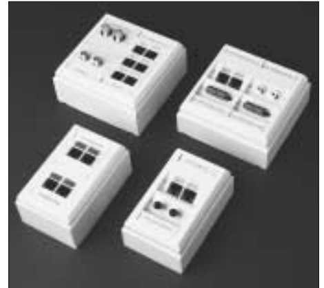
5700 Series boxes with Pass & Seymour Activate inserts.