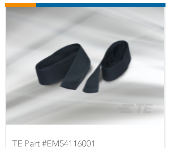
HFT5000 Heat Shrink Tubing