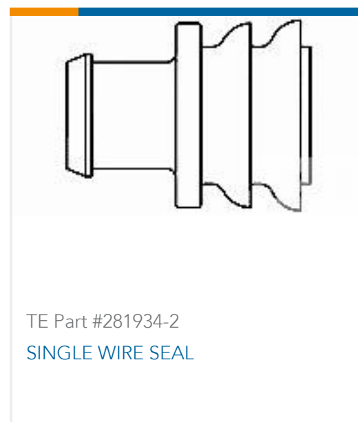
TE Part #281934-2 SINGLE WIRE SEAL