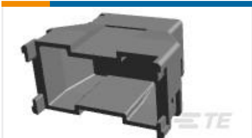
TE Part #207604-1 METRIMATE,STR REL KIT,36P