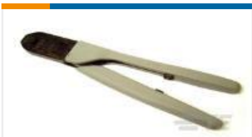
TE Part #91521-1 CCII TYPE III+ PIN SKT 18-14 ASSY