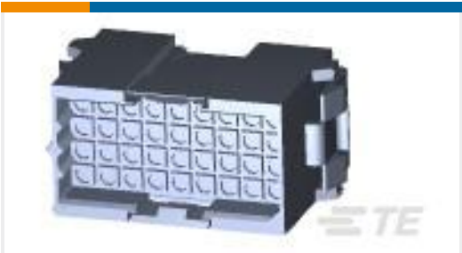
TE Part #207020-1 METRIMATE RCPT 36 POS