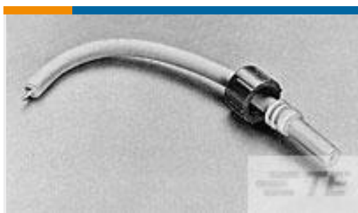
TE Part #837655-4 LEAD, SGL END ASSY, LGH