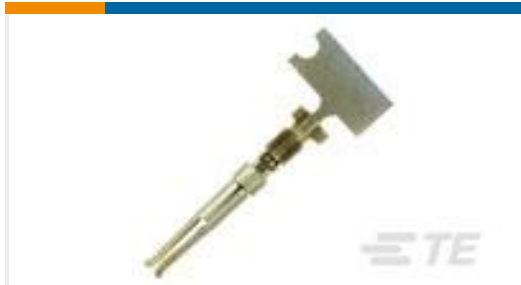
TE Part #1658538-2 SOCKET CONT DUPL PLT STRIP HD-