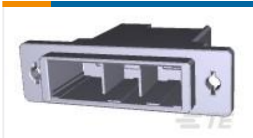
TE Part #2-353047-3 DYNAMIC D-5200S TAB HSG 3P K/Y