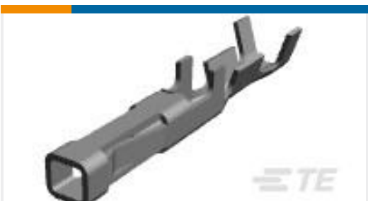
TE Part #1-794607-2 MICRO MNL RPT CNT STRP 30AU LF