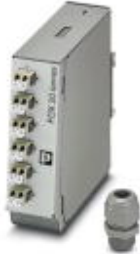
DIN rail splice box, fully mounted ready to splice, for 6x LC duplex (OM4)

Please be informed that the data shown in this PDF Document is generated from our Online Catalog. Please find the complete data in the user's documentation. Our General Terms of Use for Downloads are valid ( http://phoenixcontact.com/download )