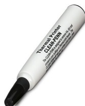
Cleaning pen, for thermal transfer printers

https://www.phoenixcontact.com/us/products/5145371