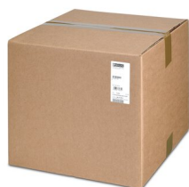
Original packaging for transportation

https://www.phoenixcontact.com/us/products/0801804